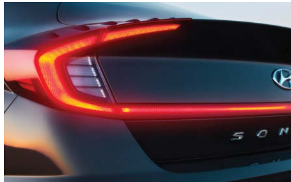
LED rear combination lamps