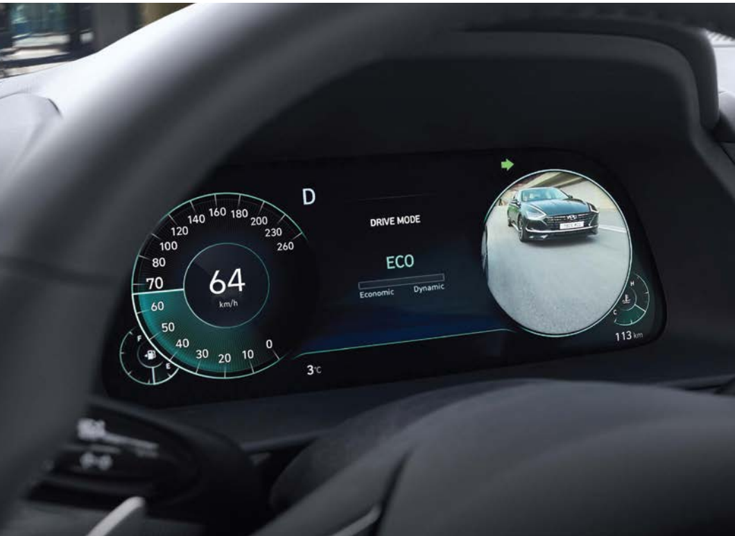
Blind spot view monitoring (BVM)

Sonata's cutting-edge safety features will always have your back. See more with Surround View Monitor, and the Blind Spot View Monitor displays the presence of an unseen vehicle. The BVM's 50-degree field of view far surpasses the coverage of the outside mirror for safer, more confident driving.