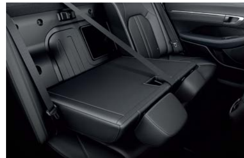
Seat folding system (6:4 type)