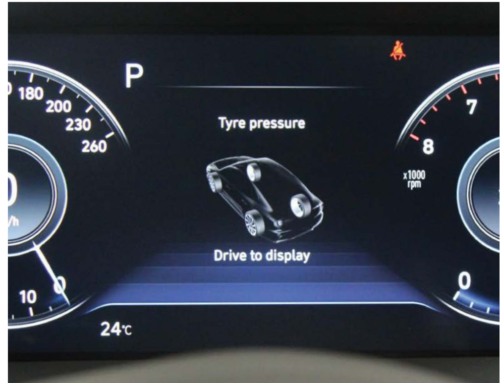
Tyres pressure monitoring system (TPMS)