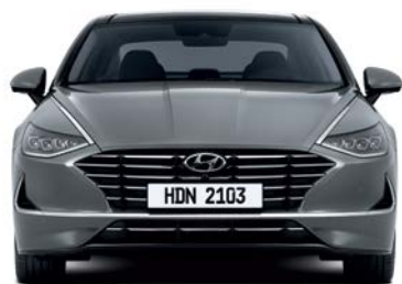
Overall width 1,860 Wheel tread* 1,618