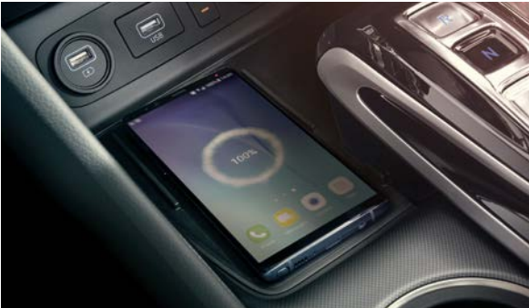
Wireless smartphone charging with temperature sensor and cooling function.