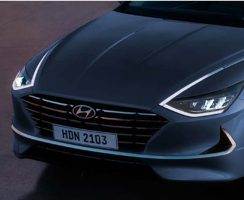
Radiator grille / LED daytime running lights (DRL) / LED headlamps (MFR type)

Sonata's high style does more than just spark the emotions. It delivers high rewards with innovative design features like the gradient hidden light technology, a sure conversation starter that adds to Sonata's mystique. Sonata's high-tech image is reinforced with LED rear combination lamps and available full-LED front lighting.