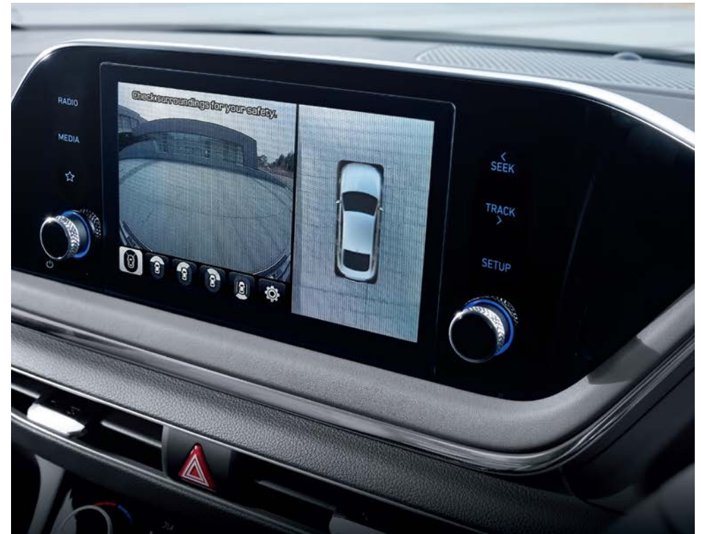
Surround view monitor (SVM)

SVM uses the AV head unit to serve up a 360-degree birds eye view of the car and its surroundings.