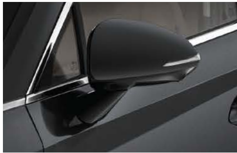
Side mirror with electric control & folding

From the exterior styling to the luxurious interior, Sonata projects sensuous comfort which served as the guiding concept throughout Sonata's development. And because today's drivers want a smart, personalised experience, Sonata answers the call with a suite of connectivity and convenience features. Whatever your lifestyle, Sonata is the perfect fit that will open the door to a whole new world of driving freedom and pleasure.