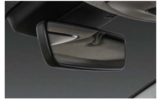
Electronic chromic mirror (ECM)