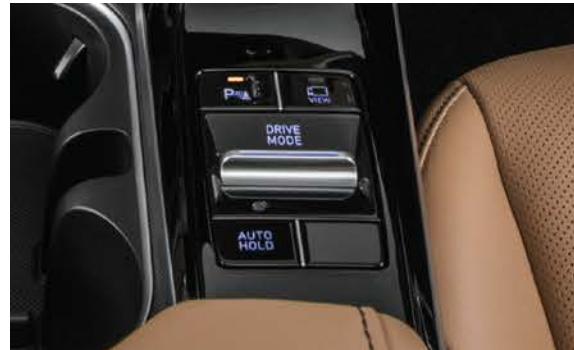
Drive mode selector and auto hold function