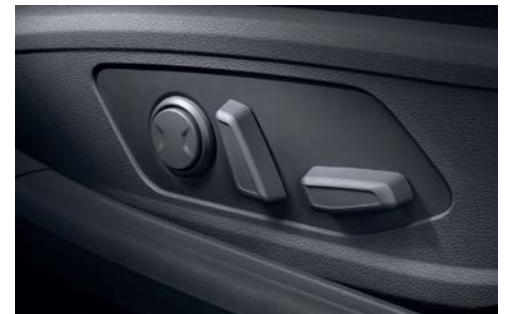
8-way power seats with 2-way lumbar support