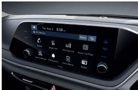
8" LCD touch screen