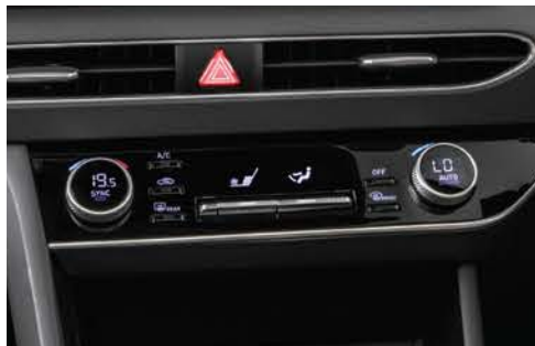
Full auto air conditioning system