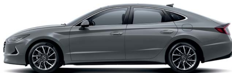
Wheel base 2,840 Overall length 4,900