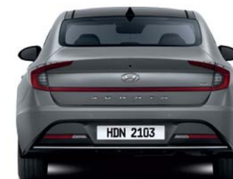
Wheel tread* 1,625