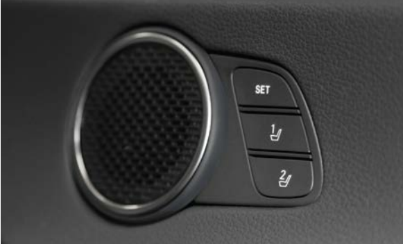
Memory seat with 2 users setting