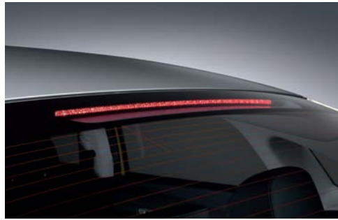
LED high mount stop lamp