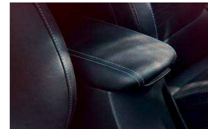
Power seats Centre armrest with blue stitching

Apple CarPlay™ is a registered trademark of Apple Inc. Android Auto™ is a registered trademark of Google Inc.