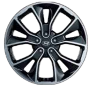
19" alloy wheel