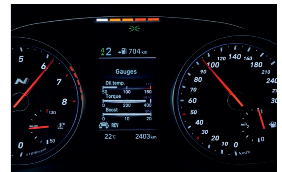
The N instrument cluster is customised for passionate drivers. You can monitor engine oil temperature, torque, and turbo boost at a glance. Featuring a shift timing to support track driving, the red zone of the variable LED rev-counter changes according to engine temperature.

The i30 N comes equipped to perform at a track day with a wide range of racetrack features for enhanced performance. Tested in extreme temperatures and extreme locations, there's no need to upgrade anything. On the track, you're supported by technologies that boost the fun factor. Launch Control helps to launch the car from standstill as easy as possible by controlling the engine torque. The Rev Matching feature automatically increases the revs on the engine when shifting so you can enjoy smoother and faster downshifts. The Overboost improves acceleration performance for a short time – perfect for getting past a difficult competitor