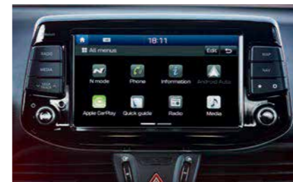
Electric folding mirrors in glossy black Smart key & Button start Apple CarPlay™ and Android Auto™