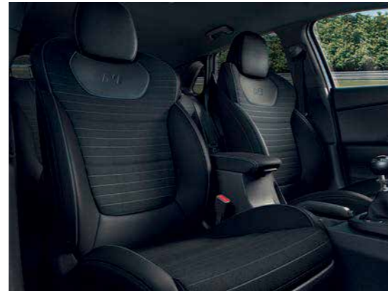
Black suede & leather combination.