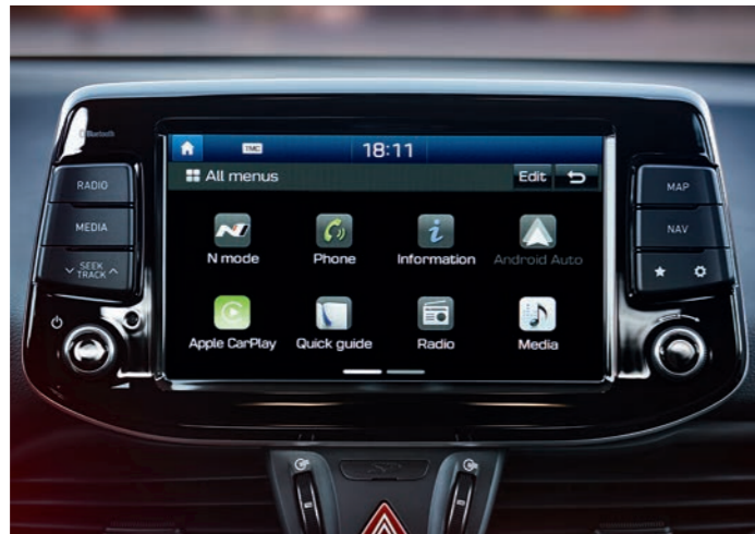
8" touch screen display