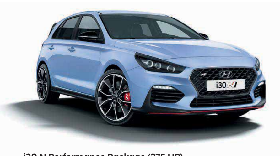
i30 N Performance Package (275 HP)