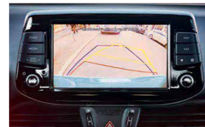
Manual cushion extension N side door sill Rear view camera