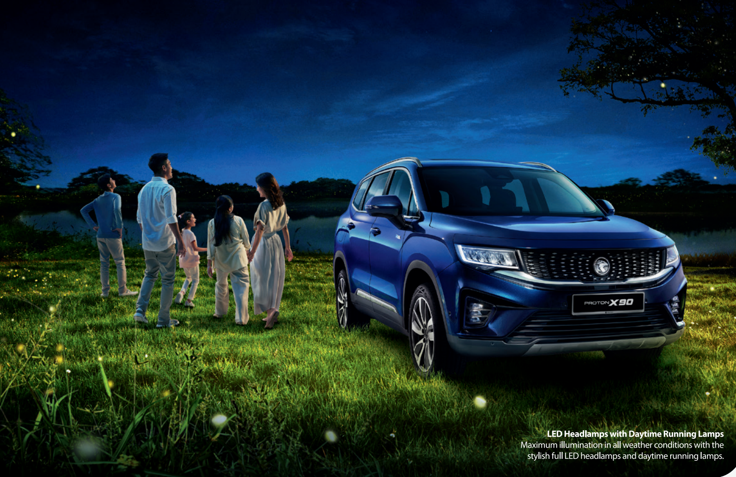
LED Headlamps with Daytime Running Lamps Maximum illumination in all weather conditions with the stylish full LED headlamps and daytime running lamps.