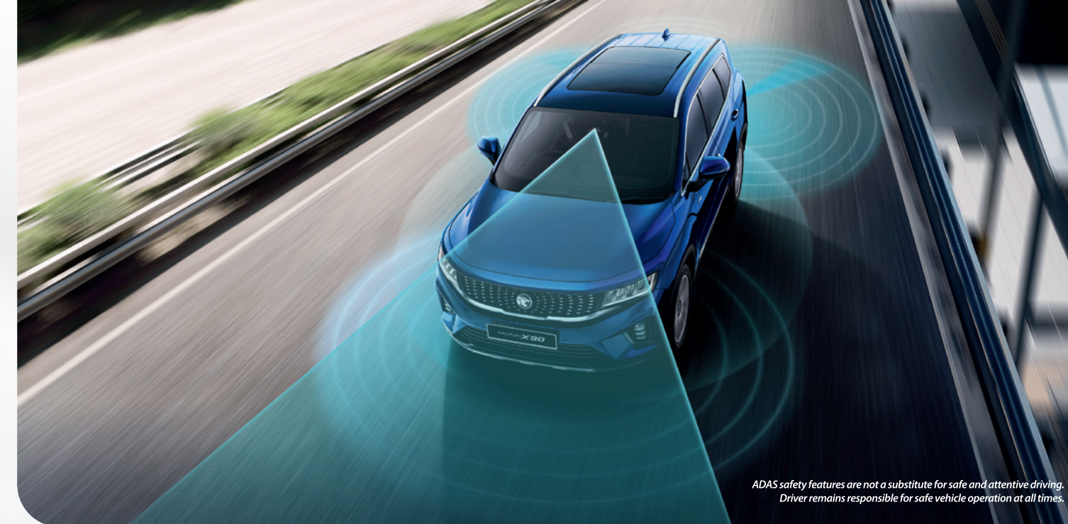
ADAS safety features are not a substitute for safe and attentive driving. Driver remains responsible for safe vehicle operation at all times.