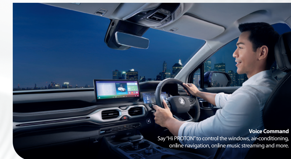
Voice Command Say "Hi PROTON" to control the windows, air-conditioning, online navigation, online music streaming and more.