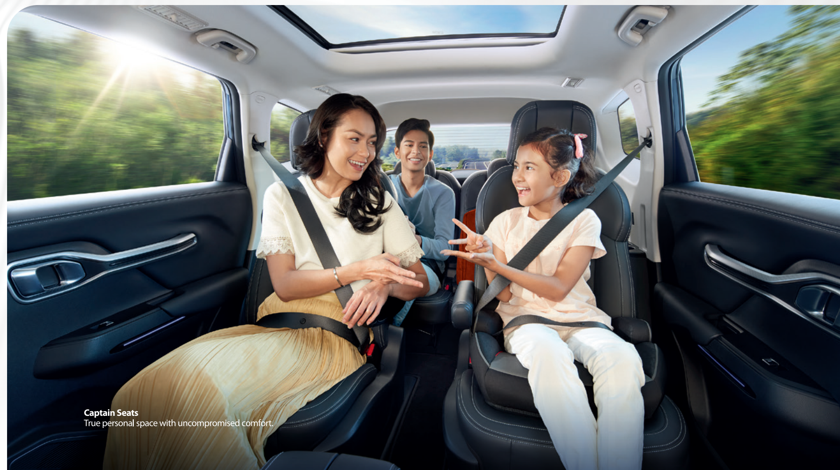
Captain Seats True personal space with uncompromised comfort.