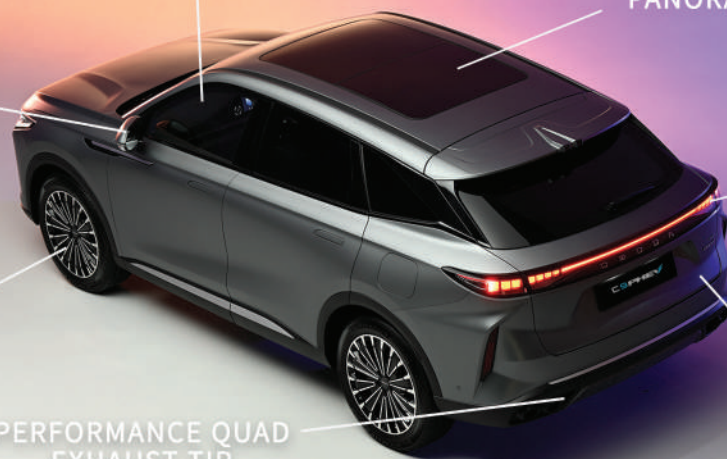
BEST-IN-CLASS BOOT SPACE 660L (ALL SEATS UP) 1,783L (REAR SEATS FOLDED)