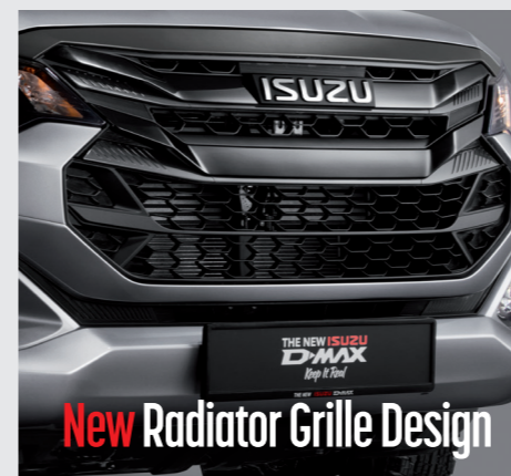
New Radiator Grille Design

The New Isuzu D-MAX Single Cab comes equipped with practical features for real everyday work, including Reverse Sensors for easier manoeuvring in tight spaces, Keyless Entry for quicker access, and a spacious cargo bed to carry tools and materials with ease, so you can efficiently get the job done.