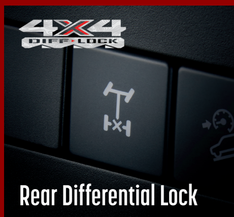
Rear Differential Lock