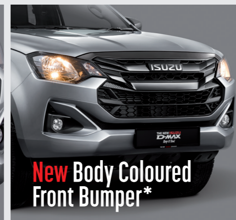
New Body Coloured Front Bumper*