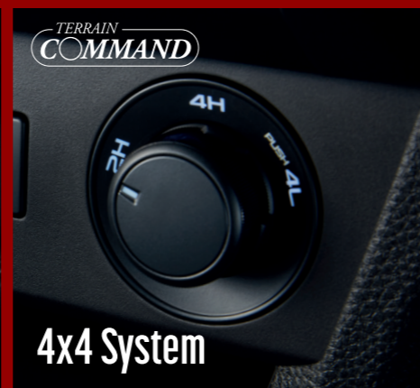
TERRAIN COMMAND 4x4 System