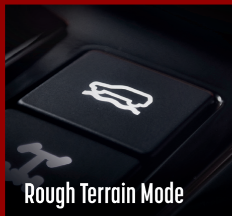
Rough Terrain Mode