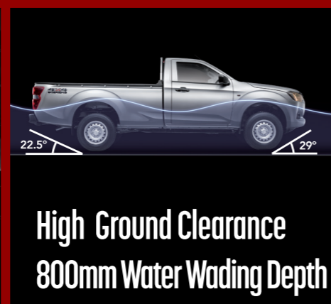
High Ground Clearance 800mm Water Wading Depth