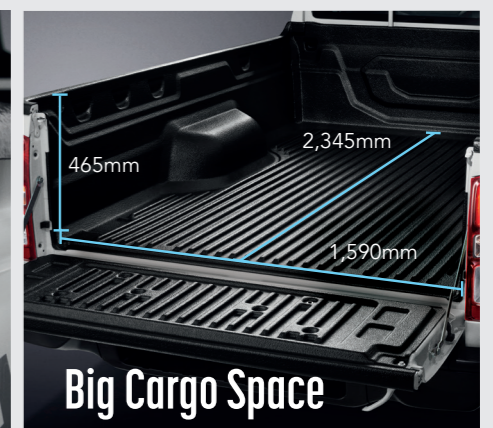
Big Cargo Space