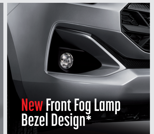
New Front Fog Lamp Bezel Design*