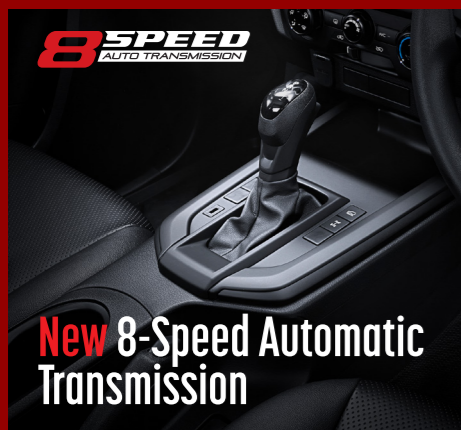
8 SPEED AUTO TRANSMISSION New 8-Speed Automatic Transmission