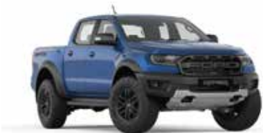
Ford Performance Blue